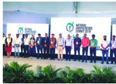
National Agripreneurs Summit 2018 in Pune, International Agripreneurs Pitching sessions, Awards and interaction with Foreign Govt. Representatives. There was upto 5 lacs cash prize for Best Agri ideas, International linkages and Investments.