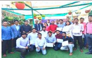
In 2020, Techathon with IIM Calcutta Innovation Park and Govt of India: EAI with BEA organized the Techathon under TIDE 2.0 Scheme, MeitY, Govt of India with IIM Calcutta Innovation Park.