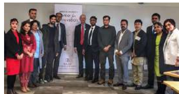
Meeting of the US Chapter members in San Francisco, California, USA