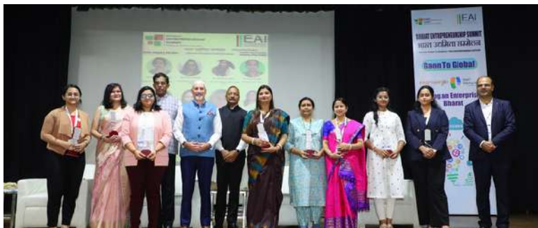
Women Entrepreneur from across India received the Bharat Entrepreneur Award at Bharat Entrepreneurship Summit, New Delhi