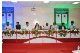
StartUp Yatra workshop in Gwalior with the commissioner and the smart City innovators