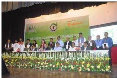
National Agripreneurship Summit, New Delhi with 700 Agripreneurs , Govt officials, Foreign Emabassies, Investors, 2017