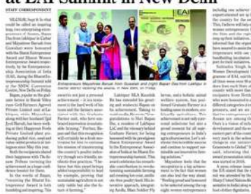
राज्य के उद्योगपतियों का समूह EAI सम्मेलन पर।

Women Entrepreneur From Jammu & Kashmir received Bharat Entrepreneur Award 2024