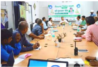
MoU signed with ICAR - ATARI for Bihar and Jharkhand at the Round Table Meet in presence of Hon Minister of Agriculture