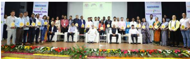
Bharat Entrepreneurship Summit 2024, New Delhi

It was of Integration of all Indian states from Kerela to Kashmir and from Gujarat to Arunachal Pradesh for Business Growth, it had State level Awards, StartUp Awards, Business Discussions and Partnerships.