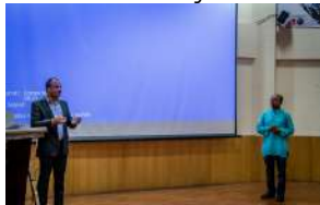
StartUp Yatra workshop in IIT Roorkee with the startups and aspiring entrepreneurs on business modelling