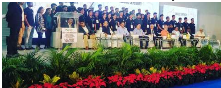
2nd National Agripreneurship Summit, Pune was organized in 2018 with 400 plus exhibitors and 50000 plus entrepreneurs in agri sector coming in a 4 day event.