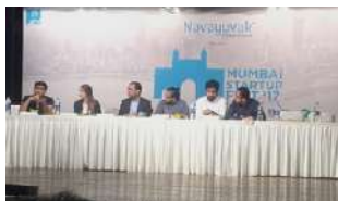
Mumbai StartUp Fest at Bandra Auditorium, Mumbai in 2017