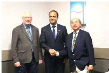
Secretary General of BEA receiving the US Govt IVLP Fellowship Medal in US by US Dept of State officials in 2020.