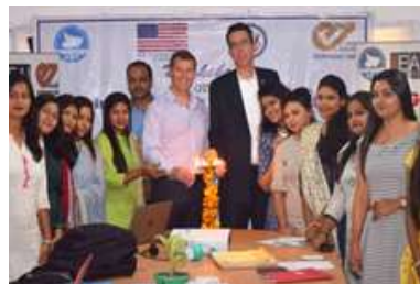
In partnership with US Consulate, Kolkata, Workshop on Business Communication in English for Women Entrepreneurs -