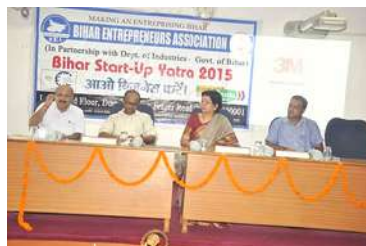
Bharat StartUp Yatra at Magadh Mahila College in Patna , 200 plus women and girl students participated and pitched their Ideas.