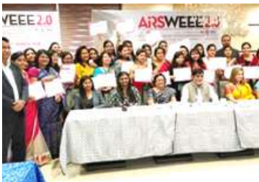
AIRSWEEE 2.0 Patna Chapter - BEA along with TiE Global successfully conducted a 5 days residence workshop program which was fully funded by US Dept of State and US Mission in India through U.S. Embassy, New Delhi, and Consulates partners. This program was meant to empower women entrepreneurs from Tier II and Tier III. Indian cities with BEA as the Regional Partner for Patna.