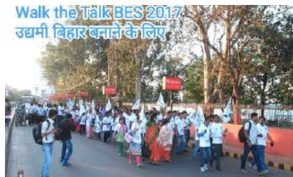
Roadshow: Walk The Talk on Udyami Bharat: Making an Enterprising India, 2017