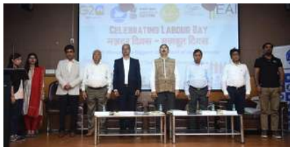
In 2023, at Delhi Public Library, Delhi as Majdoor Diwas- Maboot Diwas on Labour Day with Ministry of Culture, Govt of India